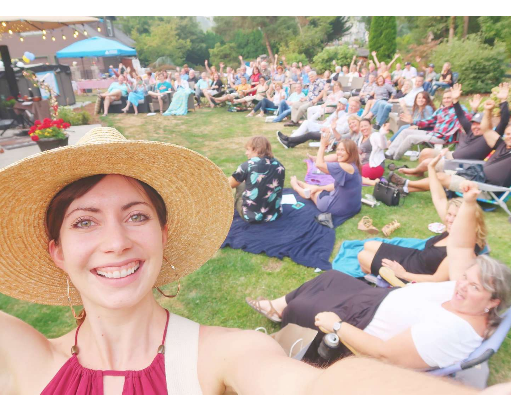
"Songstress to honor her late nephew with a fundraiser house concert tour."