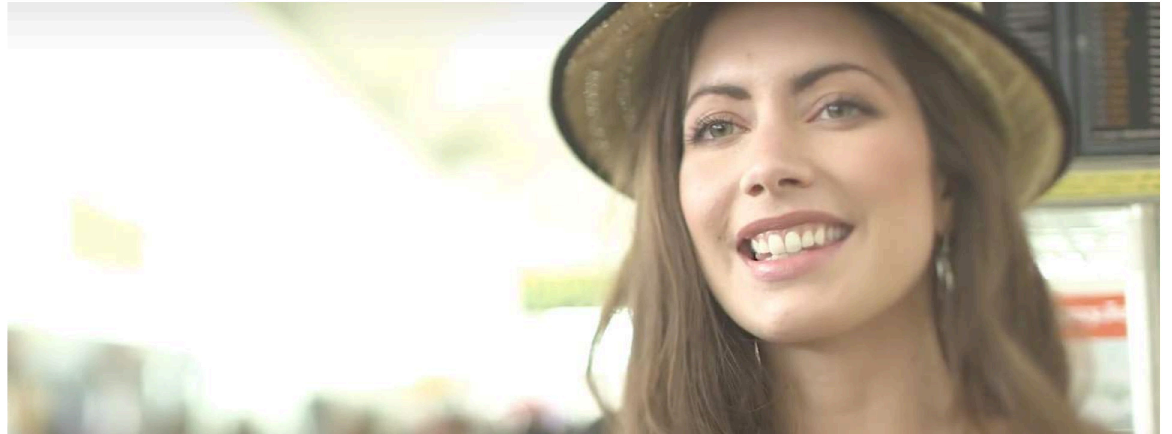
2015 Film participation with Rolls Royce UK